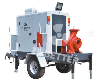
Emergency Mobile Fire Pump Truck Independent Vacuum Assist