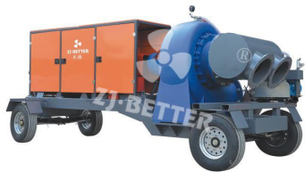
4000m 3 /h Drainage Pump Truck Independent Vacuum Assist