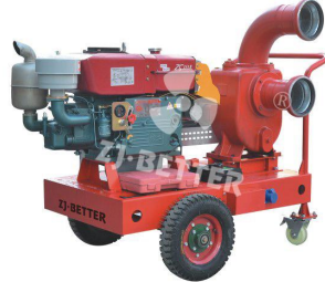
Manual Mobile Self Priming Pump Water-Cooling Diesel Engine/(Bauer Coupling)