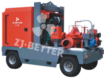
Emergency Mobile Pump Truck