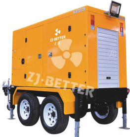
Silent Enclosed Pump Truck Independent Vacuum Assist