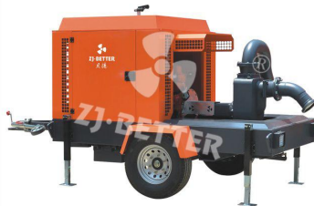
100 m 3 /h P4 Mobile Pump Truck Bauer Coupling