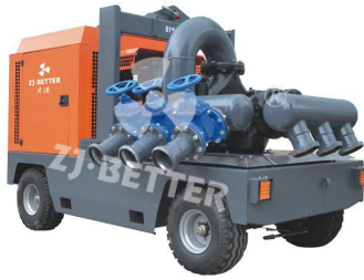
1000m 3 /h P12 Mobile Pump Truck