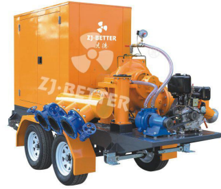
High Lift Mobile Pump Truck Independent Vacuum Assist