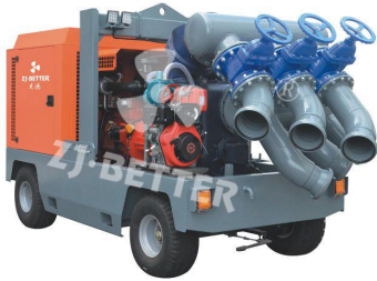
1000m 3 /h Drainage Pump Truck