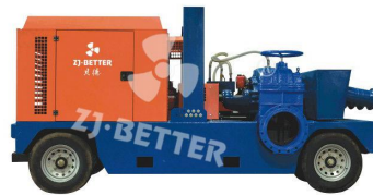
1800m 3 /h Mobile Pump Truck