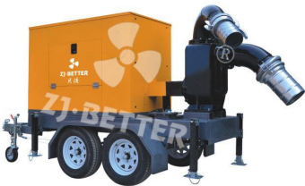
P8 Mobile Pump Truck