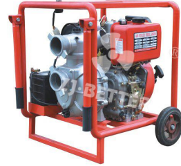
Portable Irrigation Pump Water-Cooling Diesel Engine (Aluminum Alloy)