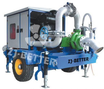
Manure Pump Truck Remote Control Independent Vacuum Assist