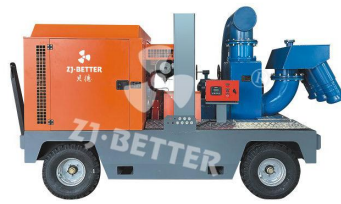
600m 3 /h Drainage Pump Truck