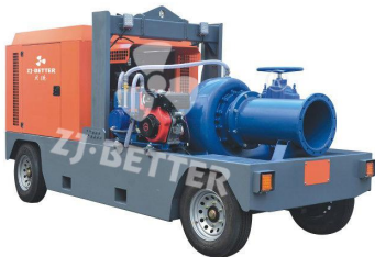
1500m 3 /h Drainage Pump Truck