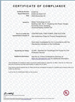
UL End Suction Pump

Better Technology Group was founded in 2004, located in Quzhou, Zhejiang, China, near Yiwu. We are an import and export enterprise integrating design, development, production, and sales of fire pumps, motors, and electrical automation controllers. After 20 years of solid operation, we have acquired 20 product-related invention patents, successively won many honors, such as national high-tech enterprise, director unit of the Fluid Equipment Professional Committee of the China Association of Water Conservancy Enterprises, science and technology enterprise of Zhejiang, etc. We have obtained UL listing approval, CE certification, ISO 9001 quality management system certification, ISO 14001 environmental management system certification, and ISO 18001 occupational health and safety management system certification. In the spirit of continuous development and excellence, we always prioritize product quality and maintain a leading position in the industry.