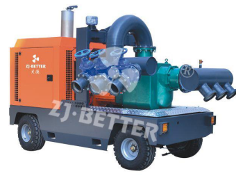
750 m 3 /h P10 Mobile Pump Truck