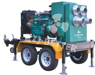
1500m 3 /h Mobile Pump Truck Independent Vacuum Assist