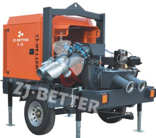
Mixed Flow Pump Truck Vacuum Assist