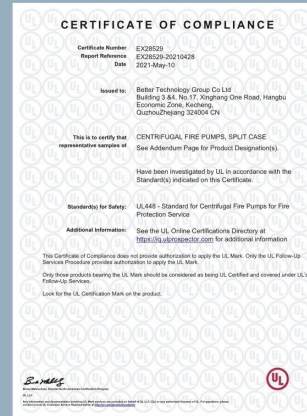
UL Split Case Pump