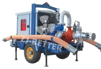
Manure Pump Truck Remote Control Independent Vacuum Assist