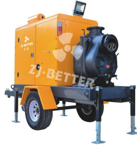
300m 3 /h P6 Mobile Pump Truck