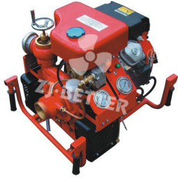
Hand Lift Fire Pump Single Cylinder Diesel Engine + Vacuum Assist