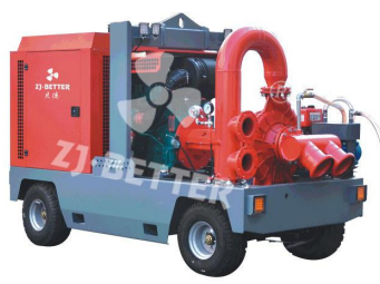
Industry Mobile Pump Truck