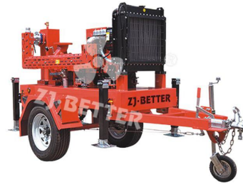
Mobile Pump Truck Vacuum Assist