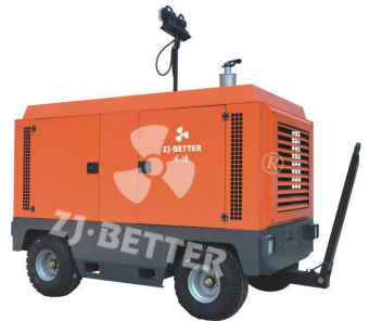
Mobile Generator Submersible Pump Truck